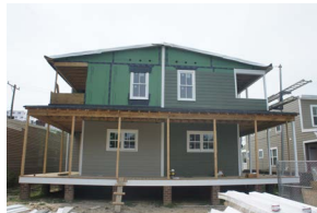
Top photos show identical finished house in neighborhood. Bottom photos show actual house under construction in July 2018.